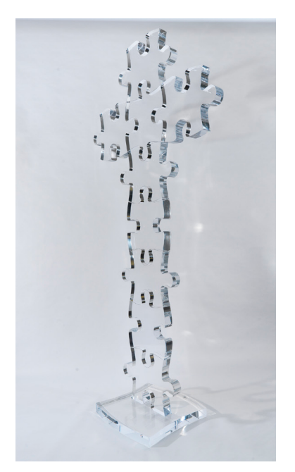
Seiya T, 2022 Puzzle pieces made from recycled plexi 240 x 50 x 6 cm

Above the illuminated cards, a prophecy which will later be found on paper or sent by email is projected on the walls of the church. "A link between sacred and profane", was Rebeiz's idea. "The works will remain in place during services in this very religious atmosphere." An actual tarot deck on paper might stem from Rebeiz's delicate paintings on polished aluminium.