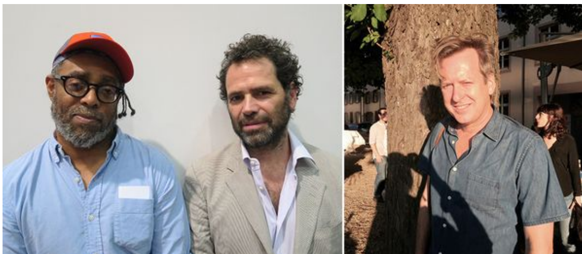
Left: Artist Arthur Jafa and dealer Gavin Brown. Right: Artist Doug Aitken.

Maddening, too. Meals, for instance, are rarely memorable for the food—generally overdone meat. Green salads are hard to come by. Cheese, however, is plentiful. So is wine and milk chocolate.