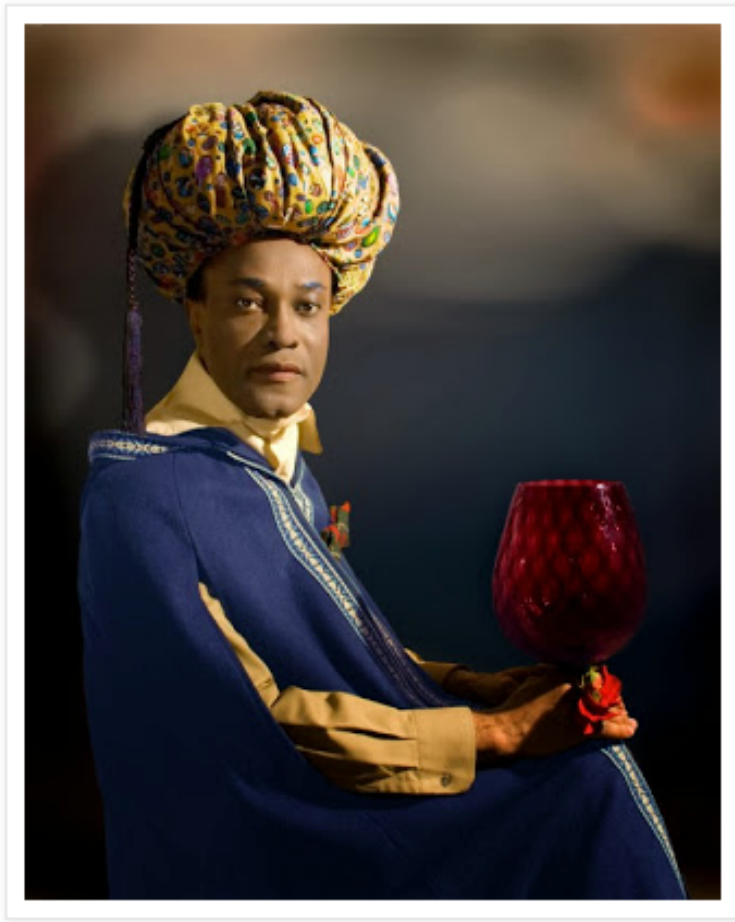
Leila Heller Gallery