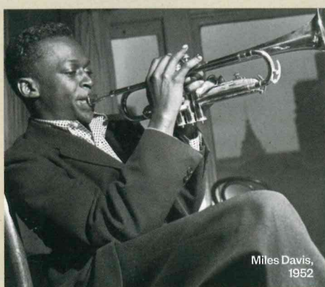
Miles Davis, 1952